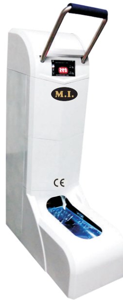
MI 160E Elite (New Model)