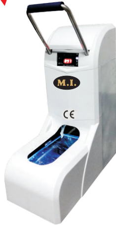
MI 80E Elite (New Model)