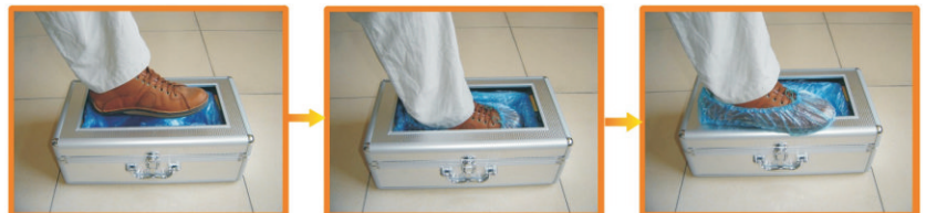
1 Step in Entire shoe into box