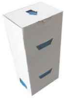
Capacity of Cartridge: 80 CPE Shoe Covers